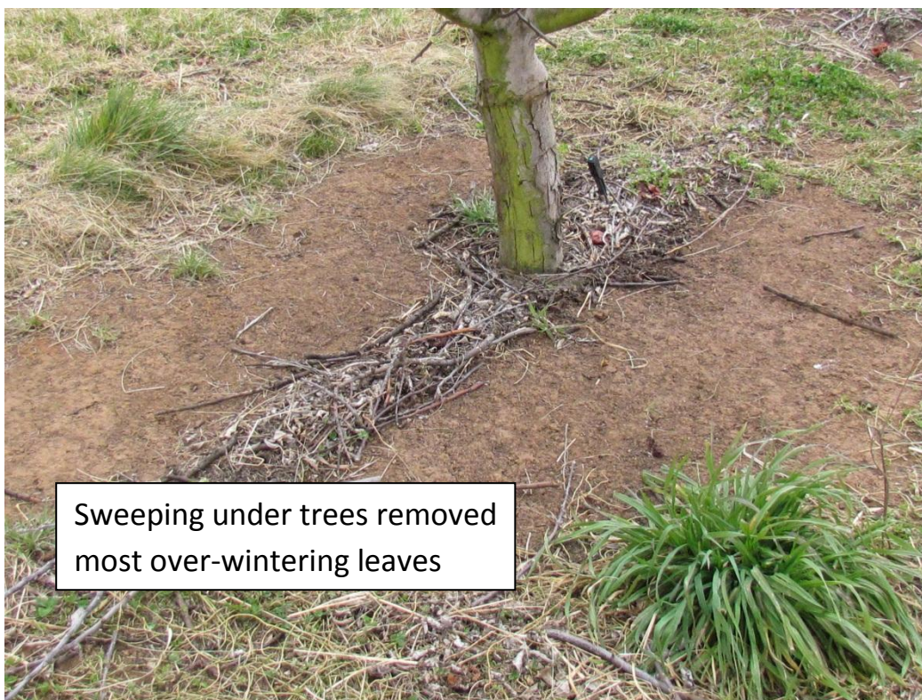
Sweeping under trees removed most over-wintering leaves