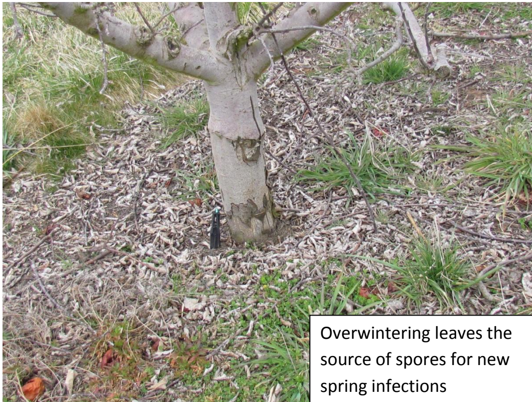
Overwintering leaves the source of spores for new spring infections